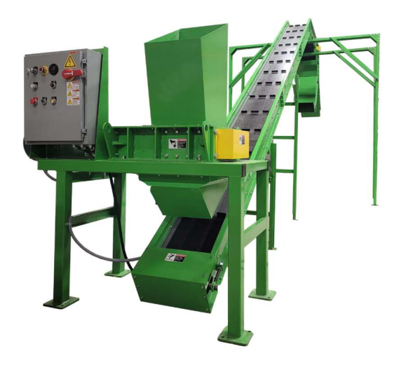
MJ 21010 Shredder with Conveyor

Note: Our shredders provide additional options and custom solutions, for additional information please contact Cannabis Waste Solutions.