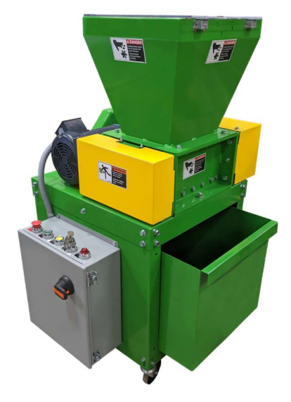
MJ 21005 Shredder with Enclosed Stand